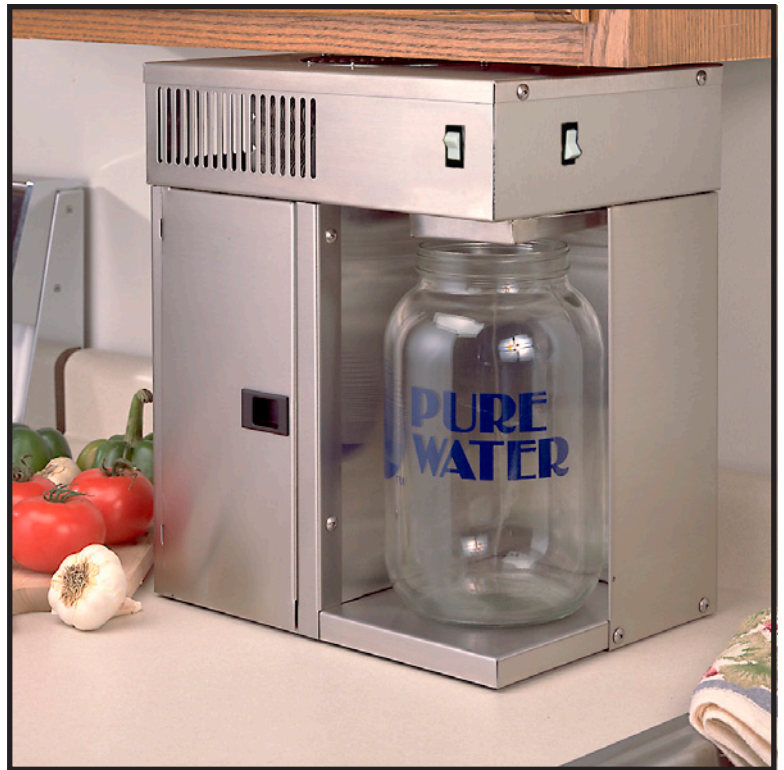
Unit shown in storage position.

No installation required. Requires no water line hookup!